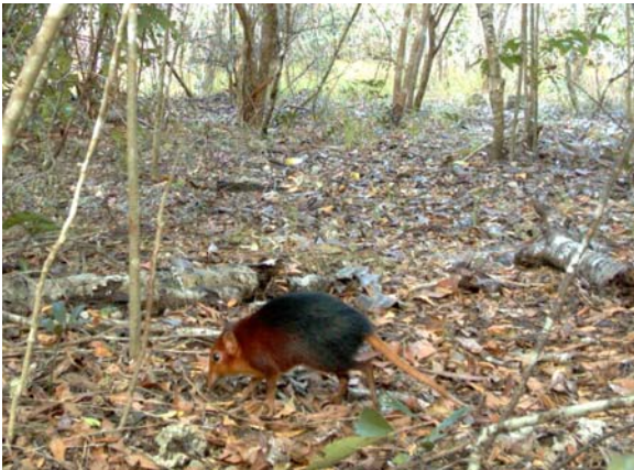
Figure 1: Camera trap image of black-and-rufous sengi ( Rhynchocyon petersi ) within the proposed Jozani-Kiwengwa Regeneration Corridor. Note continuous layer of leaf litter, despite rather open canopy and grassy opening in background.

Black-and-rufous sengis ( Rhynchocyon petersi ) are colourful 500g mammals (Fig. 1) that spend most of their time on the forest floor foraging for invertebrates. Although they are highly cursorial, they spend the night in leaf nests that they build on the forest floor. Because this species occupies fragmented, and often small, forests along the coast and in the Eastern Arc Mountains of Kenya and Tanzania (Nicoll and Rathbun 1990), it is considered Vulnerable by IUCN (Rathbun and Butynski 2008). In the Zanzibar archipelago, R. petersi is reported to occur on Unguja Island (also known as Zanzibar) and Mafia Island, but not on Pemba Island (Pakenham 1984).