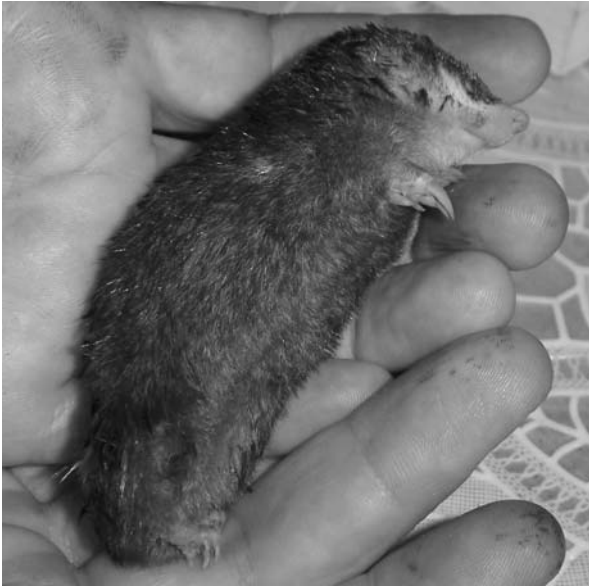
Figure 1: A Congo golden mole, Calcochloris leucorhinus , caught by a domestic cat in Batéké National Park, Gabon.

is outside the range recorded for Chrysochloris stuhlmanni (Bronner, pers. comm.).